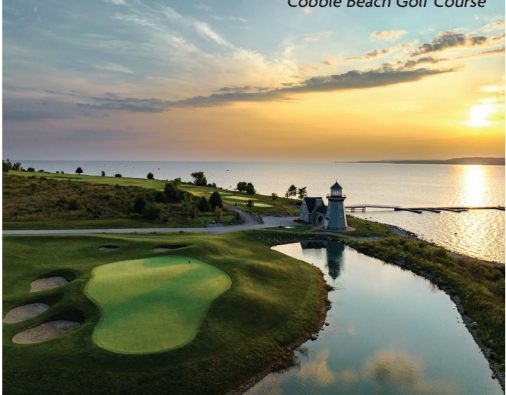
For more information visit cobblebeach.com or owensoundtourism.ca